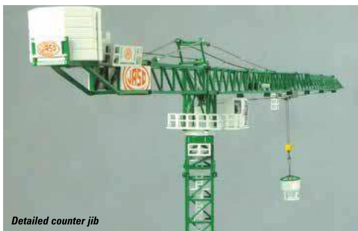
Detailed counter jib