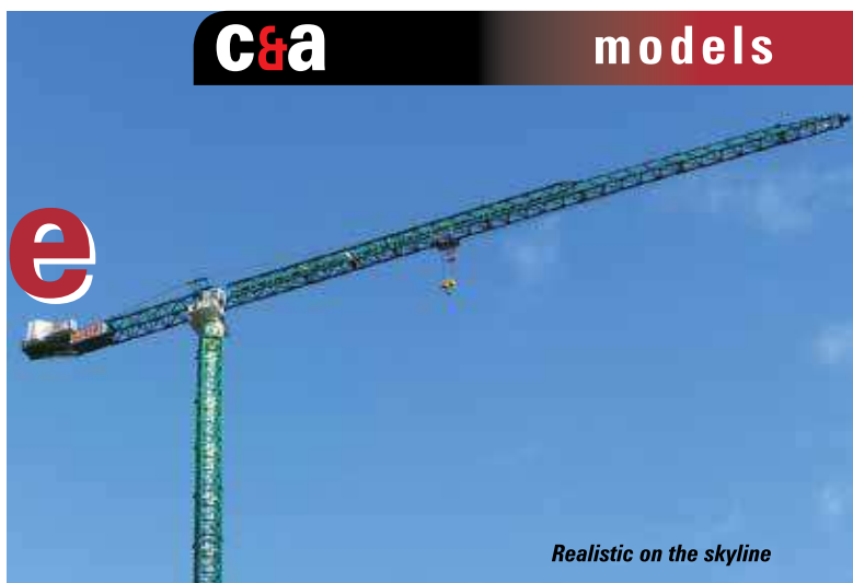
Realistic on the skyline