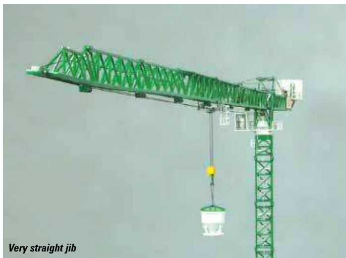
Very straight jib